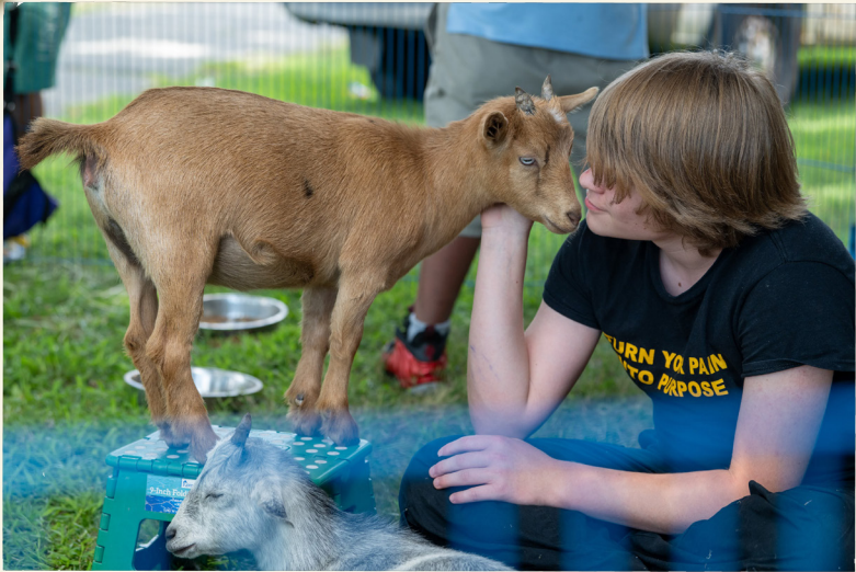
Everyone loves a baby goat.