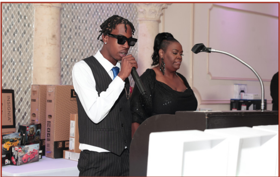
WAY participant giving a speech to his peers.

It was a magical night with presentations, awards, prizes, dinner, and dancing. Here's to 41 years of cheering them on—and to every step of the journey still to come.