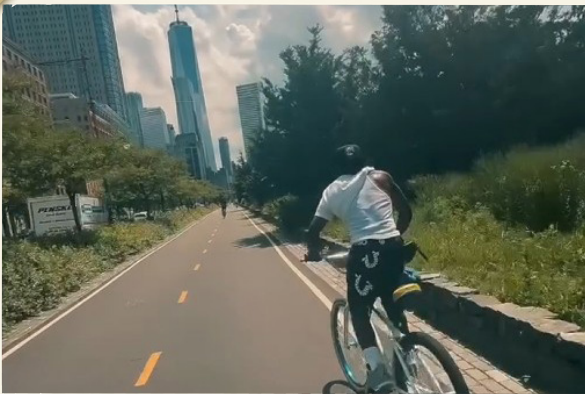
Biking trip on the West Side of Manhattan.