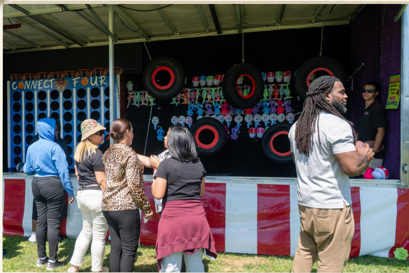
CV staff and kids try their luck at the tire toss game.

From the excitement of graduation to the glamour of prom, the older youth celebrated the milestones that mark the beginning of their lives as adults. But our kids also had the chance to be kids, biking, fishing, and enjoying fun and games (and a petting zoo) at the Agency BBQ. For many of our kids, this is the first time they have ever caught a fish, pet a goat, or played a carnival game. With your generosity, we have provided them with experiences they will remember forever.