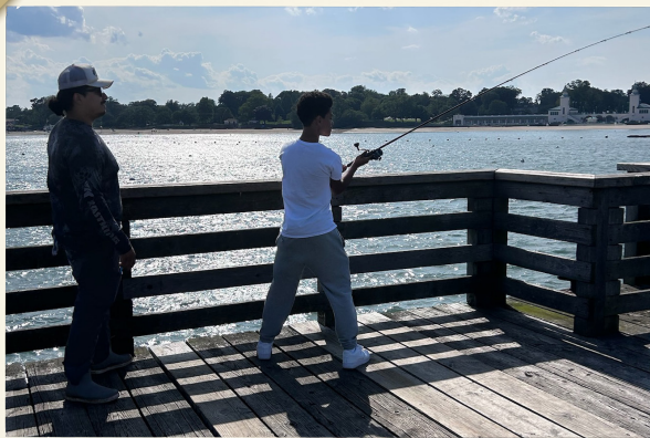
First time fishermen on a pier.