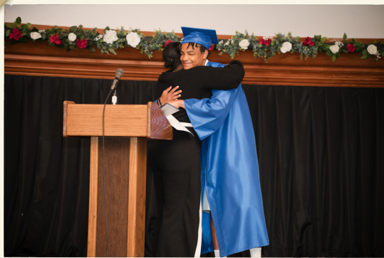
We are so proud of the class of 2025!