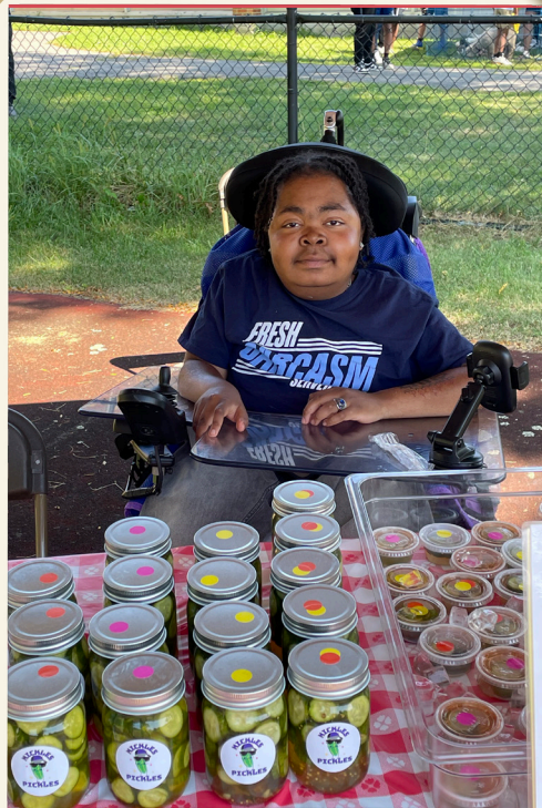
Nico's Pickles always sell out!