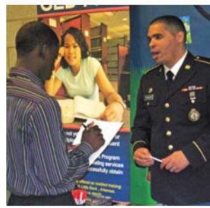
Students explore career opportunities, including the military, at Career Awareness Day.

Volunteer "Life Coaches" helped the students choose business tables to visit and are continuing to work with the students as part of a monthly Career Club. As part of this club, Life Coaches help the students identify interests, do research, and take real steps to prepare for a career.