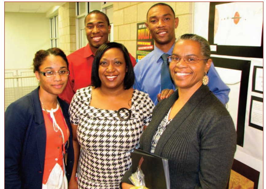
PepsiCo adopted a cottage on our Dobbs Ferry campus three years ago, and they visit every month to play games, share meals, and get to know the boys.