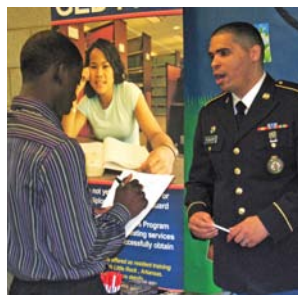
Students explore career opportunities, including the military, at Career Awareness Day.